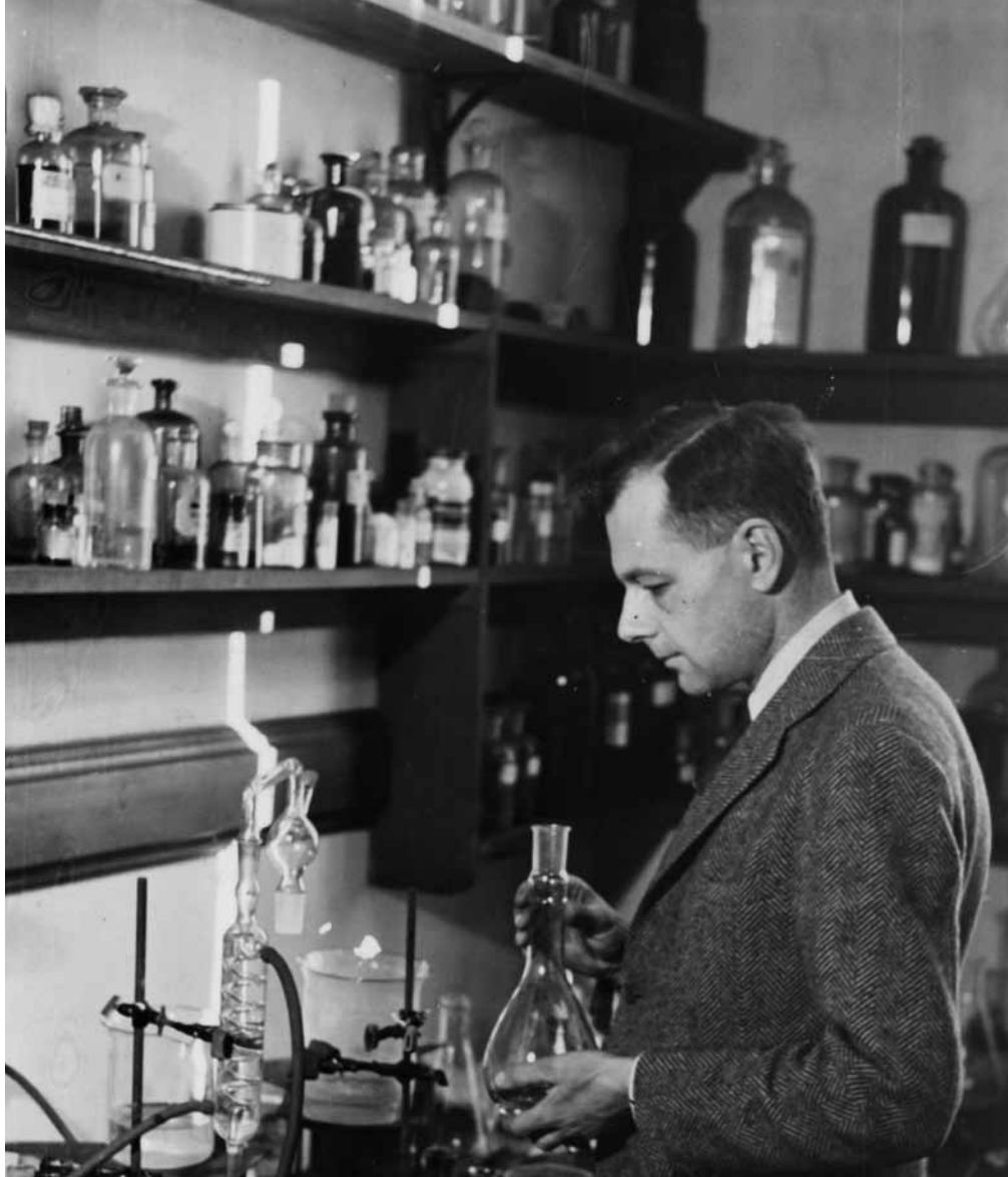
Hutchinson, pictured here in his laboratory in 1939 at age 36, never earned a PhD. Nevertheless, his talents were recognized early, and he spent his career as a professor at Yale University. His research there set the foundations for the fields of limnology and ecosystem science, and he mentored some of the most influential names in 20th-century ecology.

Over time, what began as marginalia became the core of some of Hutchinson's greatest research accomplishments. More than three decades