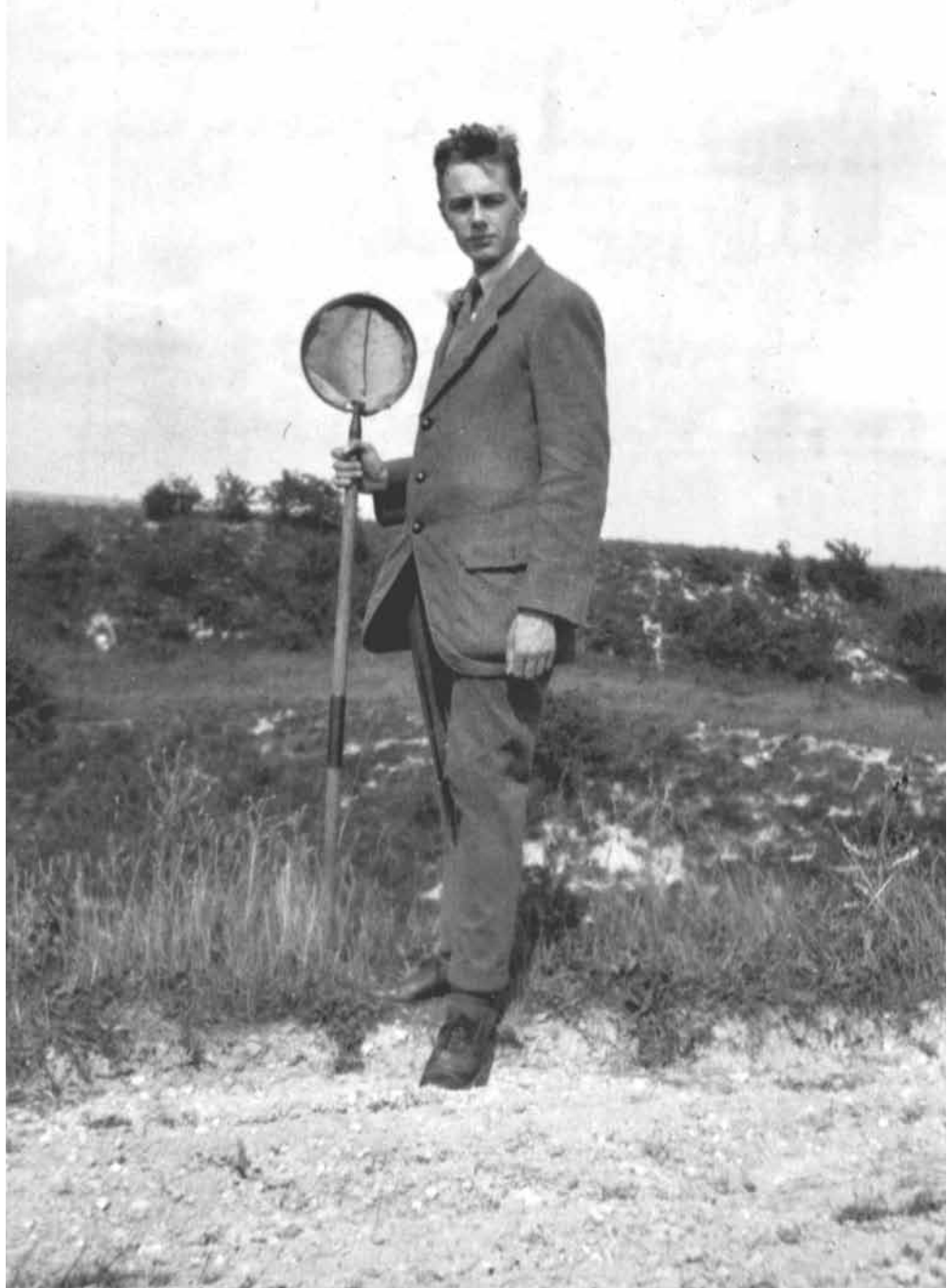
Hutchinson, shown here at age 17 collecting the froghopper Philaenus spumarius, published a study on the species the following year (in 1921). Hutchinson had begun describing species and publishing papers in scientific journals at age 15.

In his first few Marginalia columns, Hutchinson stuck close to his interest in biochemistry, summarizing papers on topics that included the structure of blood proteins, the uptake of magnesium by bacteria, and the regulation of metabolism by the thalamus. But soon he began to cover other disciplines, including geology, archeology, and astronomy, always through the lens of the organism. Some of the connections he drew between the macroscale and the microscale were tenuous and unconvincing. Others were profound.