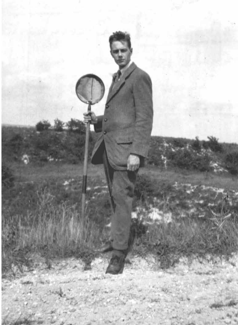
Hutchinson, shown here at age 17 collecting the froghopper Philaenus spumarius, published a study on the species the following year (in 1921). Hutchinson had begun describing species and publishing papers in scientific journals at age 15.

In his first few Marginalia columns, Hutchinson stuck close to his interest in biochemistry, summarizing papers on topics that included the structure of blood proteins, the uptake of magnesium by bacteria, and the regulation of metabolism by the thalamus. But soon he began to cover other disciplines, including geology, archeology, and astronomy, always through the lens of the organism. Some of the connections he drew between the macroscale and the microscale were tenuous and unconvincing. Others were profound.